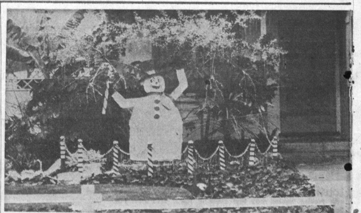
SNOWMAN —A seasonal home decoration of a home at Opal and Fonthill Streets. This year is the snowman who appears in front.

Admittance to this forthcoming concert is by season ticket or single admission may be purchased at the box office.