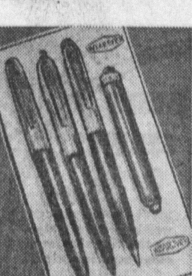
WEAREVER 4-PC. SET

Fountain pen, a me-chanical pen-cil, ball-point pen and a flashlight.