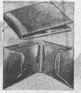
BILLFOLD FOR MEN

Stitch-less 1-8-view pass case...black, *Plus tax