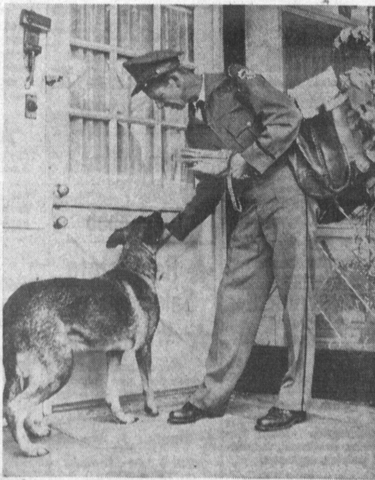
LET MADDUX Will the Dog Bite?