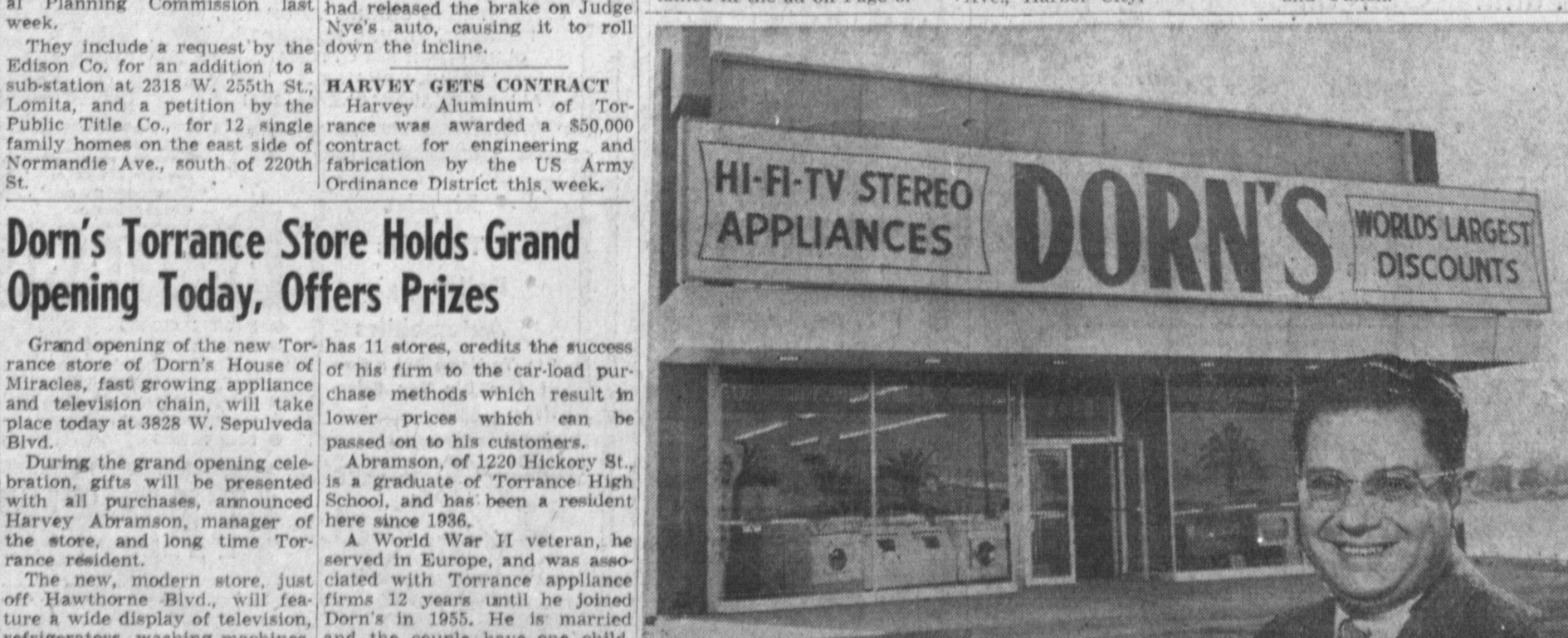
GRAND OPENING-Dorn's House of Miracles will hold its grand opening today at its new Torrance store, 3828 W. Sepulveda Blvd. Firm offers huge selection of appliances and televi-

And as a measure of protection, and fer better traffie direction, additional policemen are on duty in the downtown