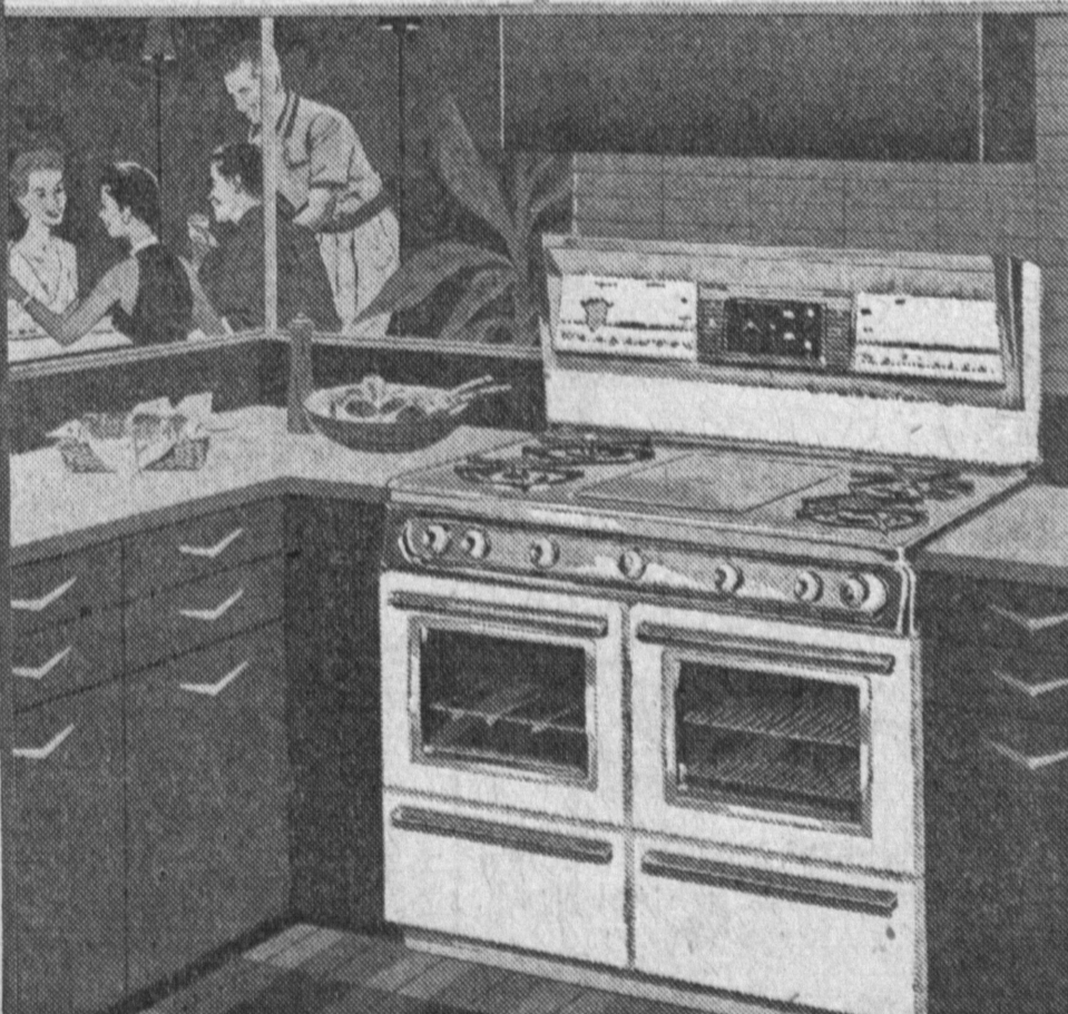
Automatic Gas range illustrated is the new WEDGEWOOD-HOLLY.

1. TOP BURNER HEAT CONTROL makes any pan automatic . . . ends pot-watching! All you do is set the thermostat. The "burner with a brain" takes over. The sensing element takes the pan's temperature constantly . . . turns the flame up or down as needed to maintain the exact level of heat you desire. No boil-overs . . . no scorching!