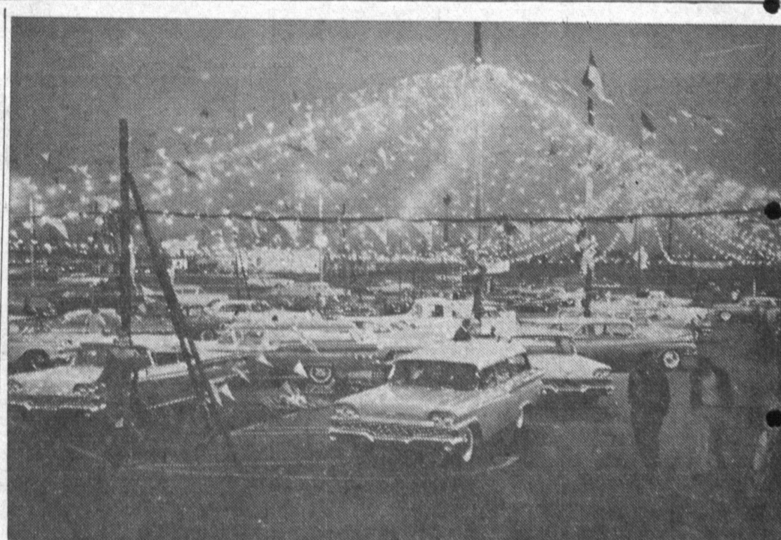
SPECTACULAR DISPLAY—of the new 1959 American motor cars is the offering this week at South Bay Center, 174th Street and Hawthorne Blvd. The show concludes Saturday after receiving record throngs throughout the early part of the week. The show is staged daily from noon to nine p.m. and is free of admission charge. Over 60 cars are on display under this canopy of lights on the East section of the huge 5800 stall parking lot.