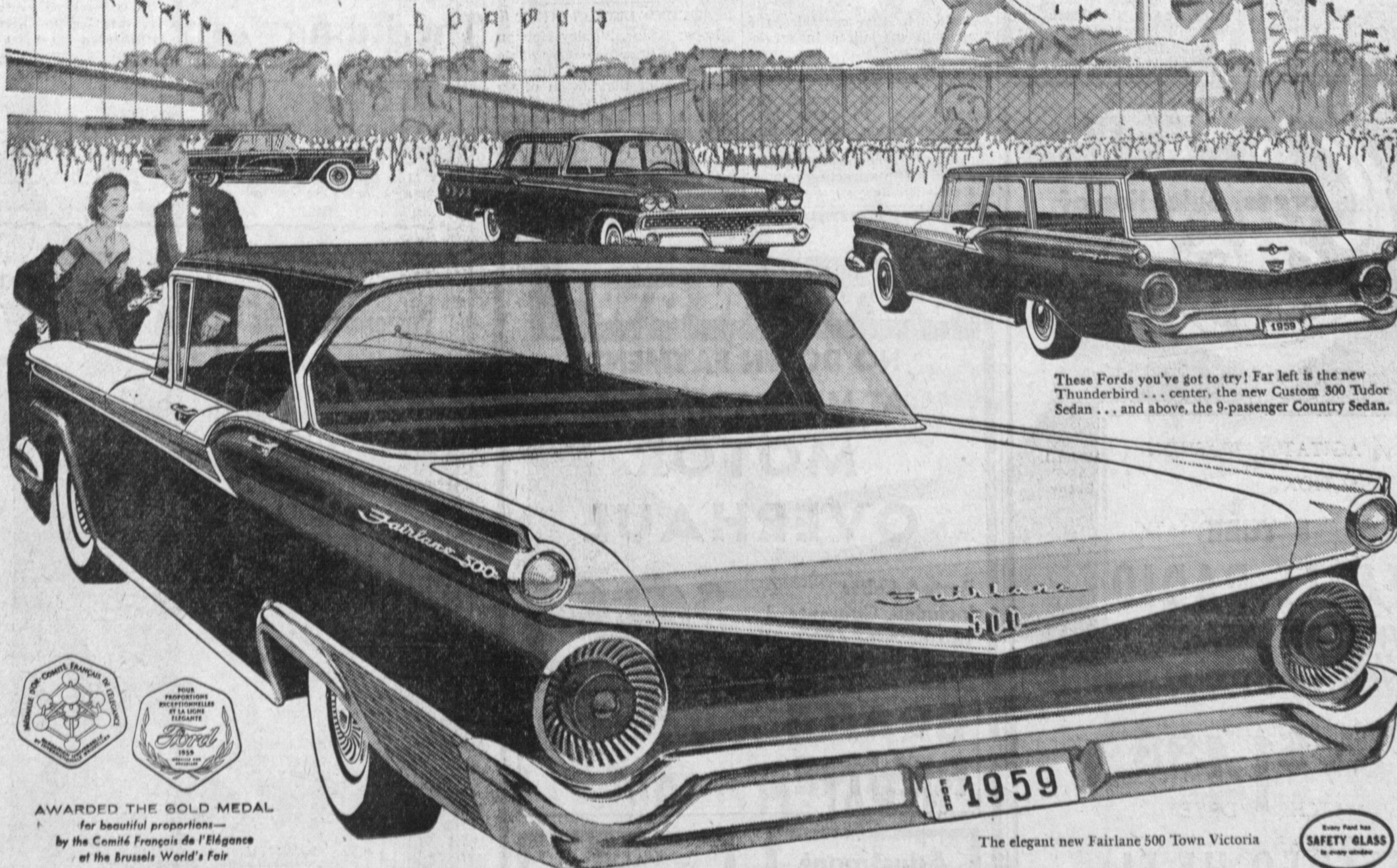
These Fords you've got to try! Far left is the new Thunderbird... center, the new Custom 300 Tudor Sedan... and above, the 9-passenger Country Sedan.

HERE TOMORROW! Ford brings Thunderbird elegance to the low-price field with THE WORLD'S MOST BEAUTIFULLY PROPORTIONED CARS