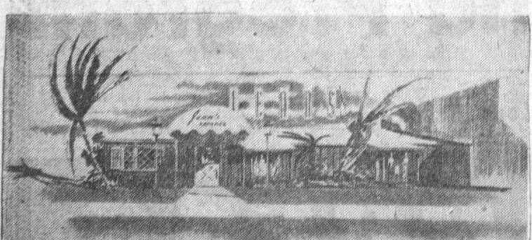
New Jean's Style Center