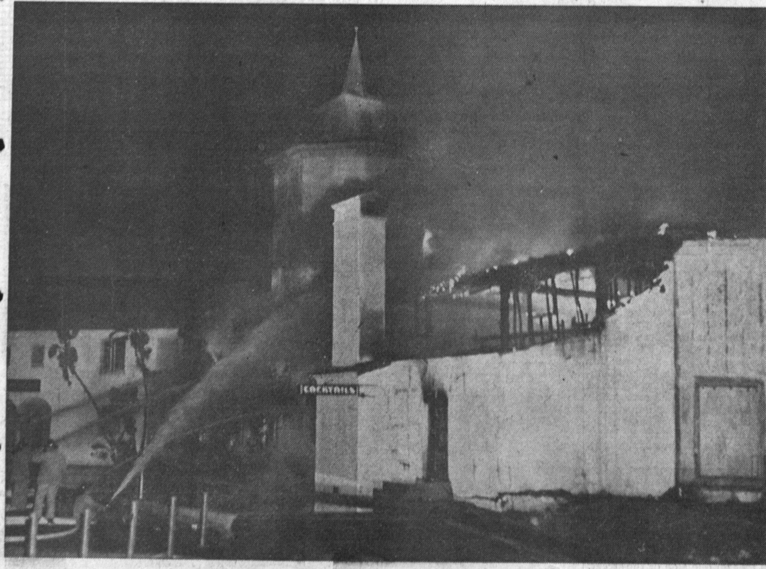
CLUB FIRE—Firemen are battling the flames sweeping out of the Hollywood Riviera Club, which was destroyed in an early-morning blaze Thursday. Ten fire companies from Torrance and