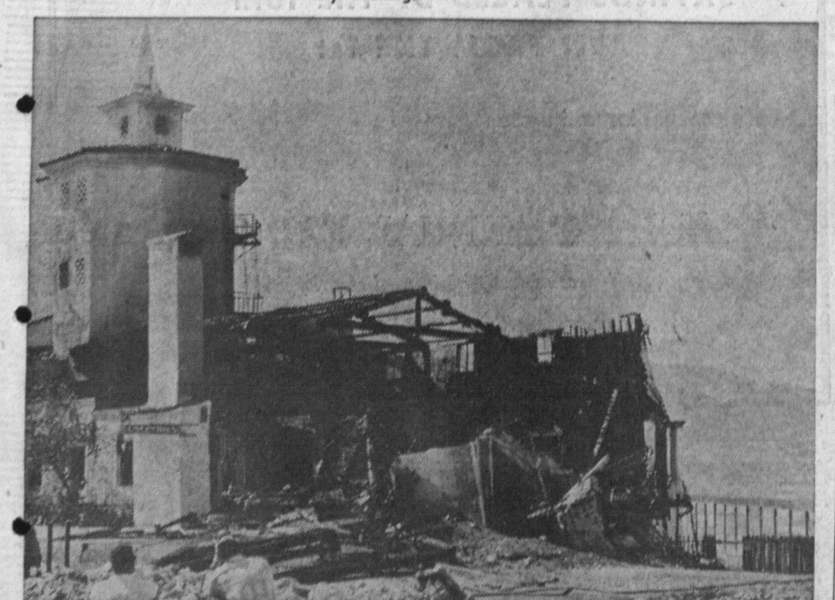
THE OTHER SIDE—This part of the building, which contained the bar and dance floor, received the heaviest damage in the fire. Blaze broke out in northwest corner of the club house