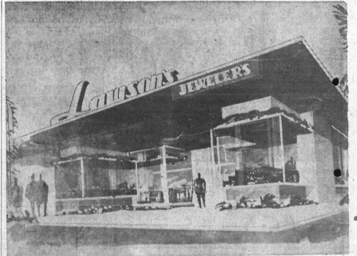
MODERN BUILDING—This is the architect's drawing of the new store building for Lawson's Jewelers at the corner of El Prado and Sartori, which will be completed in a few weeks. The firm, which has served Torrance for the past eight years, will begin a huge moving sale at its present location, 1317 El Prado, today in anticipation of the move.