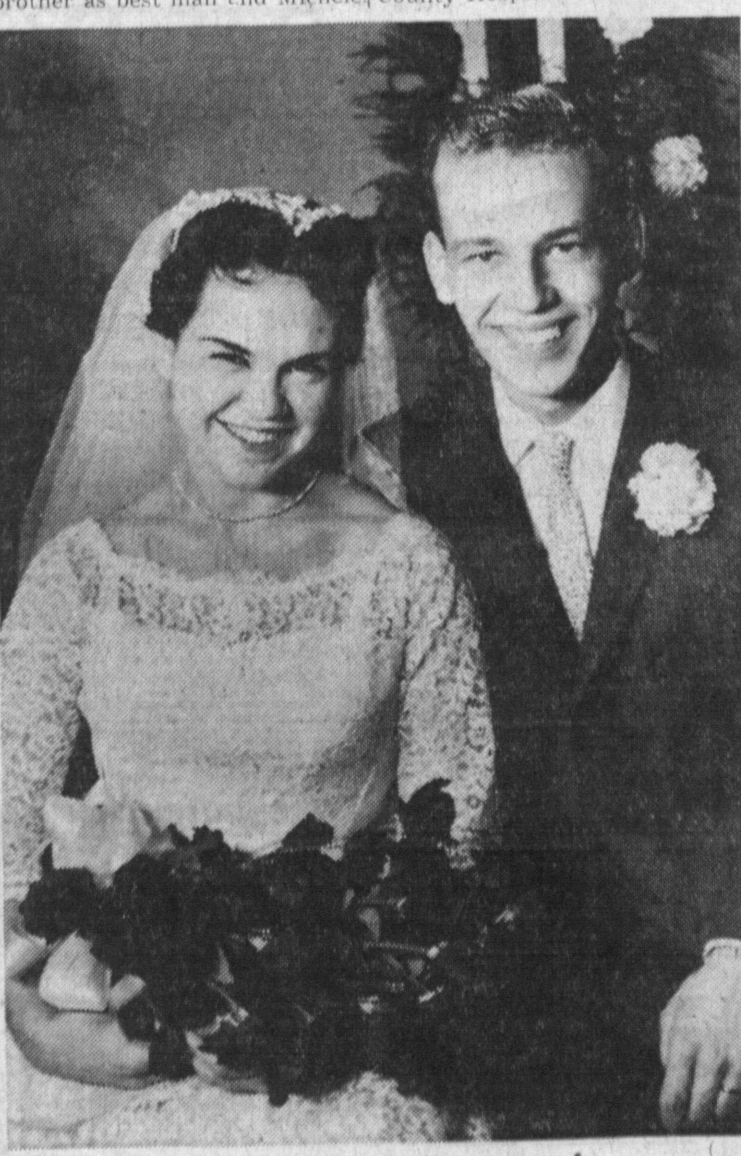
MRAATID FIRS, EARRY PURPILITOIT Exchange Vows

BY POPULAR DEMAND We Repeat This Offer Again 30 TREATMENTS $35 Regular $60 Course