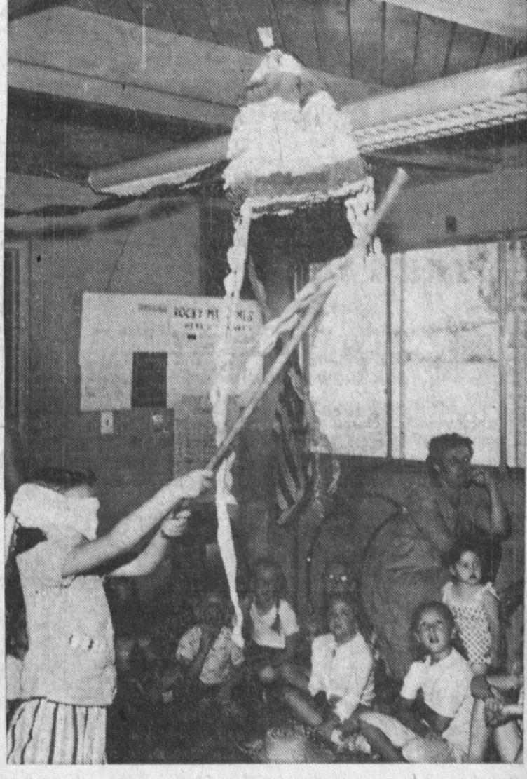
TRYING FOR GOODIES-Blindfolded girl attempts to break pinata with a stick during a Spanish program in El Nido Park this week, as others watch from safe distance. The pinata was finally cracked open after 45 minutes of trying and youngsters scrambled for candy which spilled out.