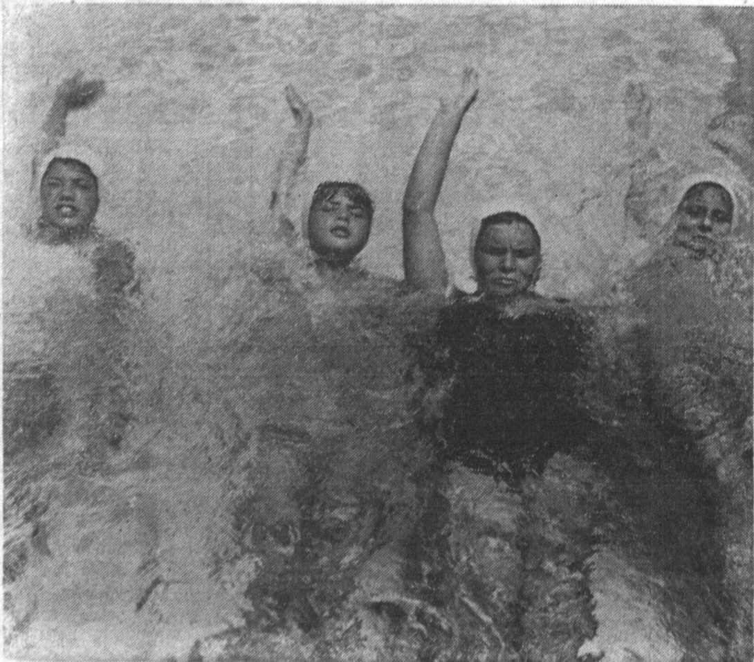
MERMAID SHOW —Splashing it up for the Aquacade to be held in Benstead Plunge tomorrow and Saturday as part of Rancho Days