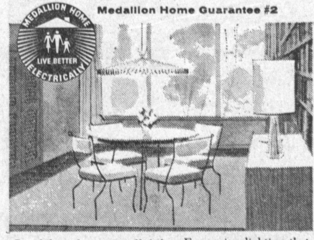
Provisions for proper lighting. Eye-saving lighting that is both decorative and functional - carefully planned and located when and where you need it.