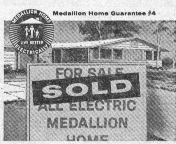
Insured resale value. Because tomorrow's living will be electrical living, a Medallion Home will be modern for years to come. Your investment is protected.