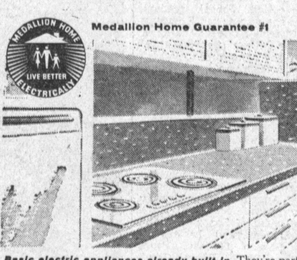
Basic electric appliances already built in. They're part of the original house plan-not out-of-pocket extras. They're placed to afford you a maximum of electrical convenience.

(Every Medallion Home does...yet costs you no more!)