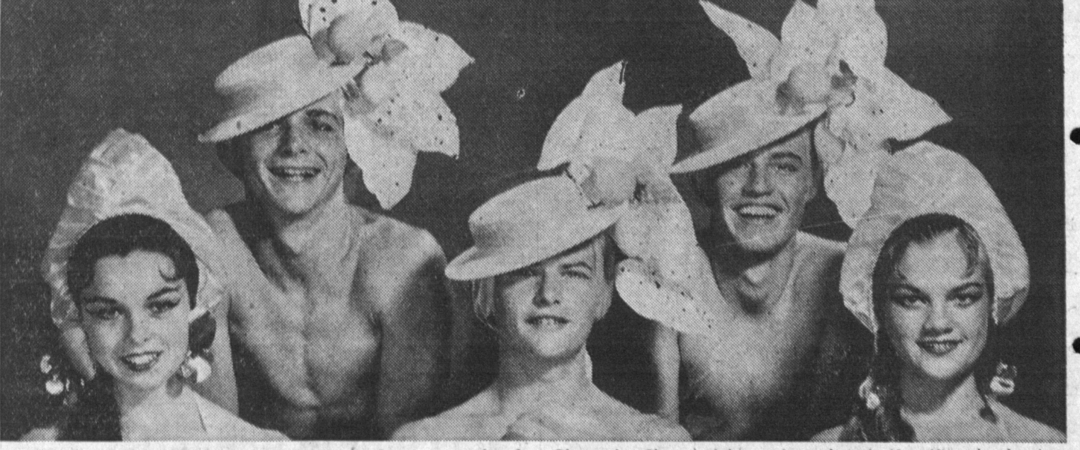
SOUTH BAY Children's Center will benefit from proceeds of annual recital of the Village School of Dance, presented June 12 and 13 at Redondo High School. A featured number was a