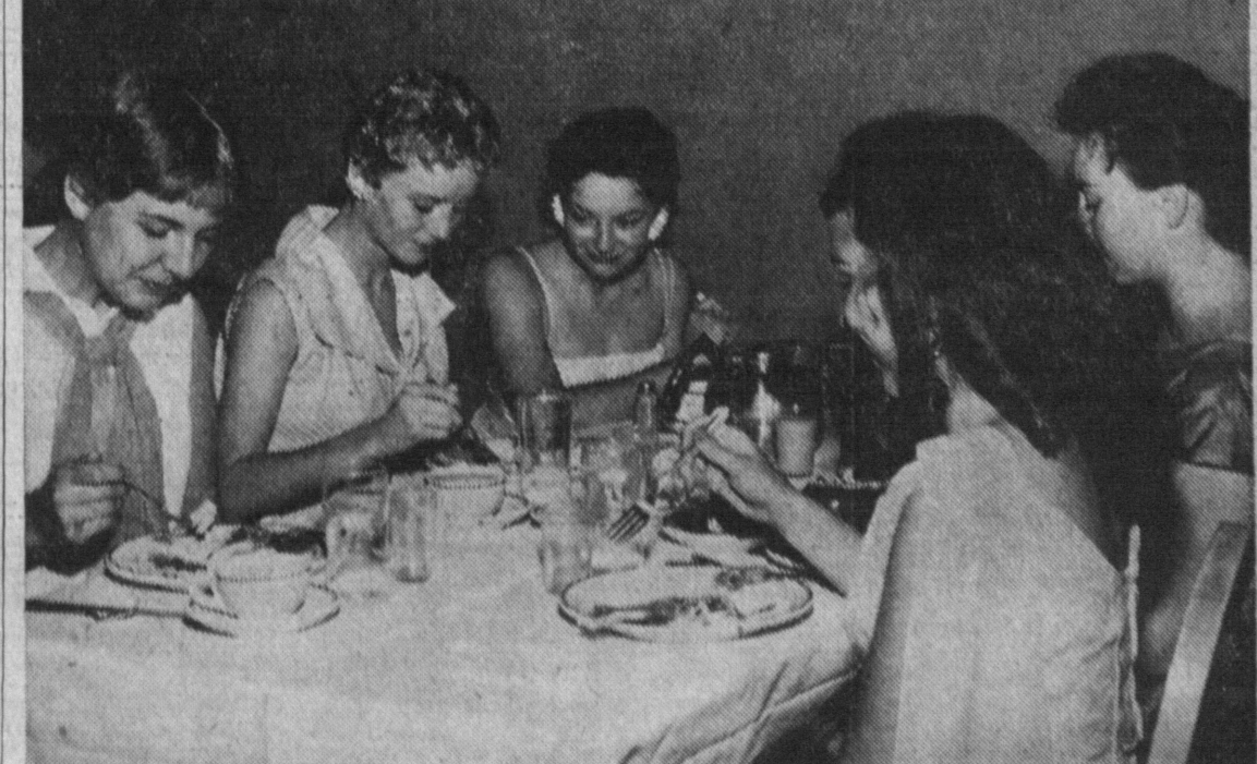
SELECTIVE SOLITUDE—This quintet of Torrance High School grads has shunned all male company during a midnight supper. They are