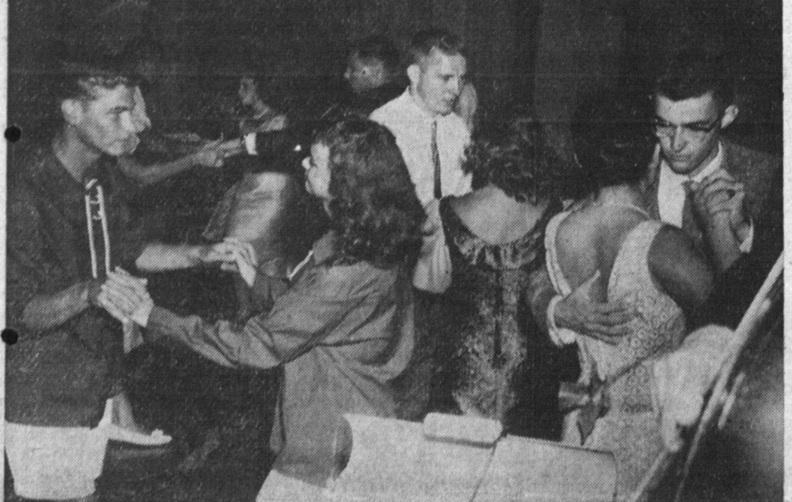
AVING A BALL-At the Torrance High School all night party at the Pacific Coast Club are the graduates of the class of '58. Couples in

LEEPERS-Must have been the time and not the company that