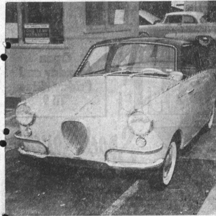
TINY CAR-The Goggomobil, produced in Germany, is the newest line of cars flow available at Newcastle Sports Cars, 505 Pacific Coast highway, Hermosa Beach. Agency sells and services various foreign cars, of which the Goggomobil is the latest