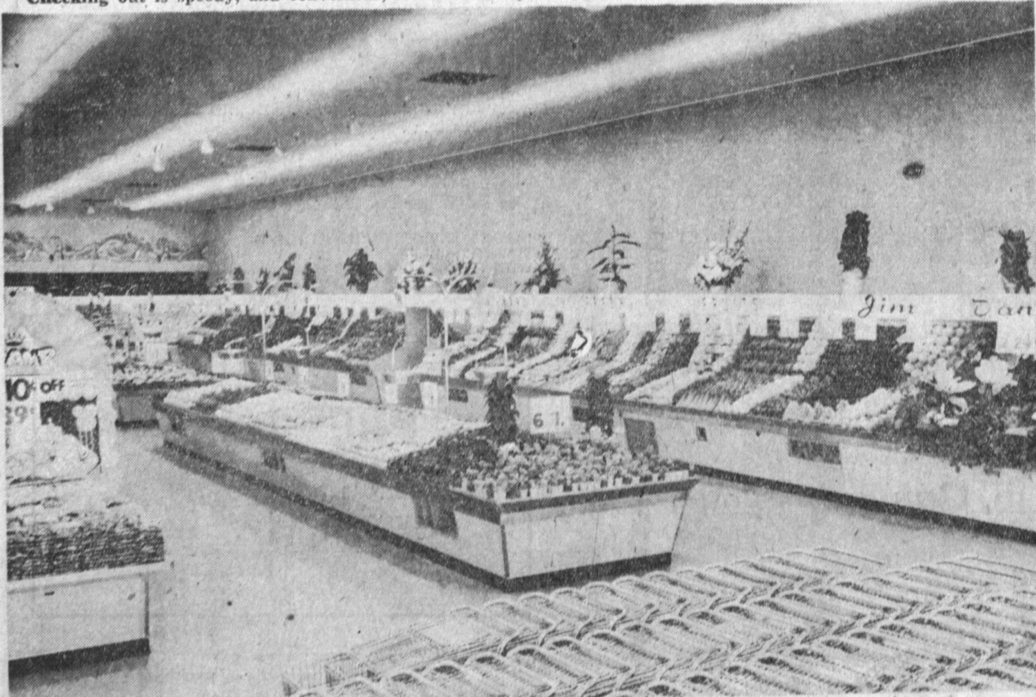
Farm-fresh vegetables and produce, in infinite variety, await the shopper who wants quality on a budget.