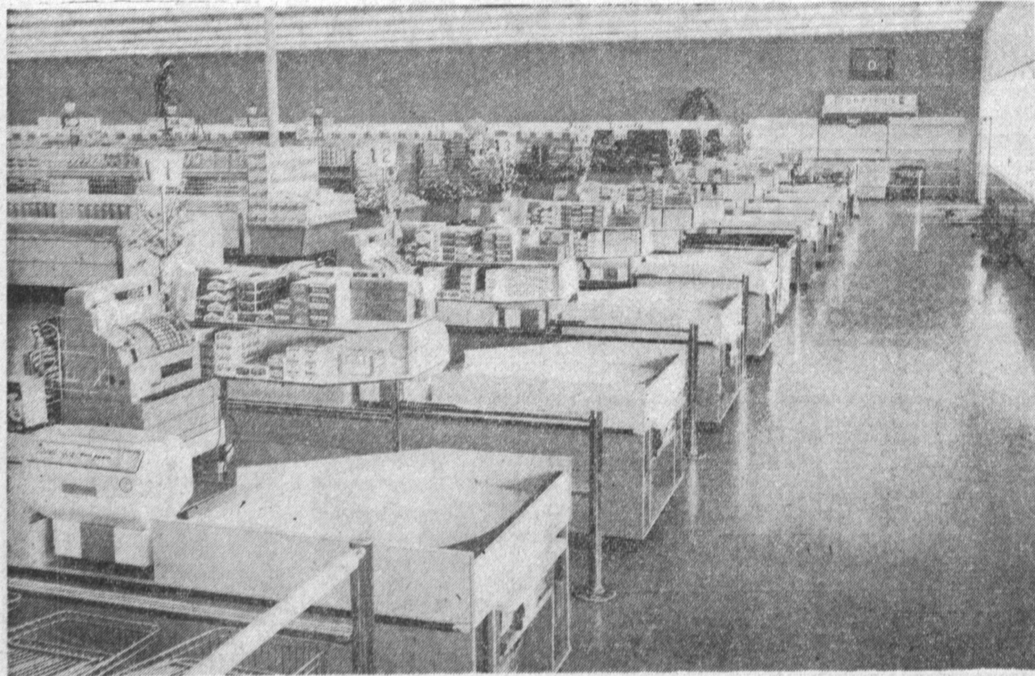
Checking out is speedy, and convenient, for Jim Dandy shoppers via these ultra-modern checkout facilities.