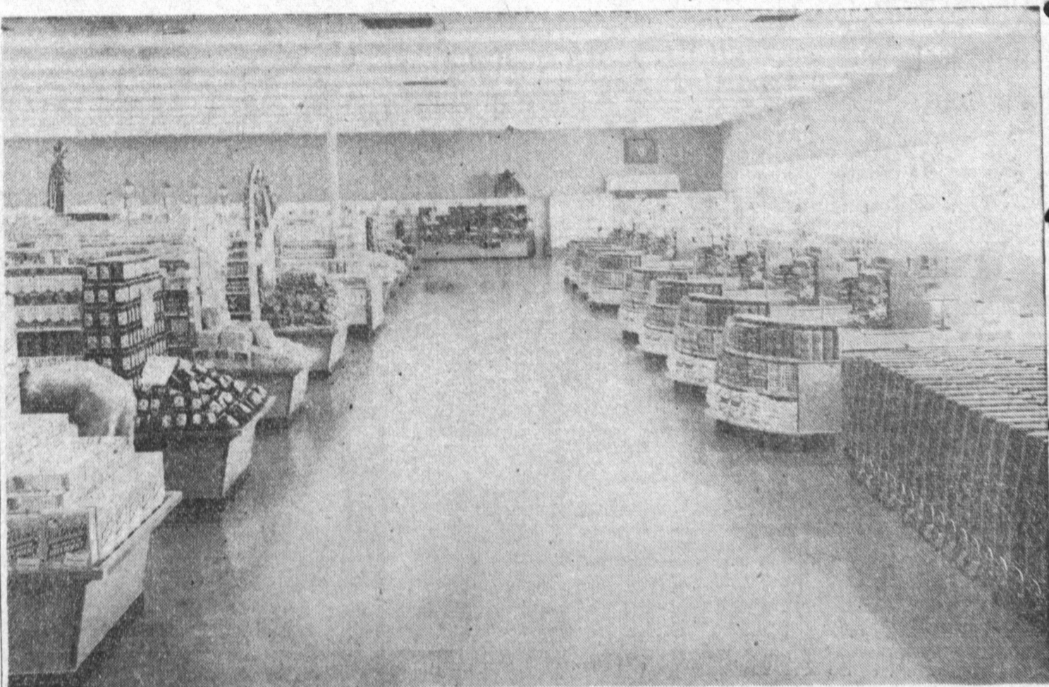
No "one-way traffic" signs are needed in the wide aisles at Jim Dandy's newest supermarket.