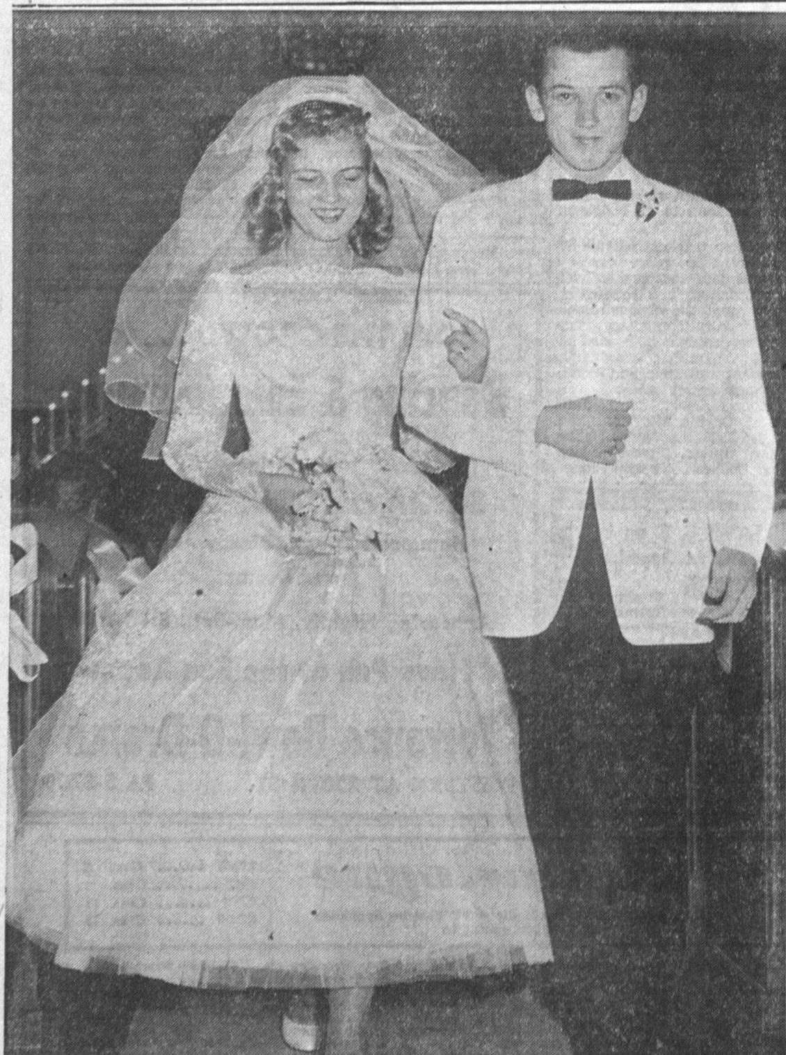
BRIDE AND GROOM