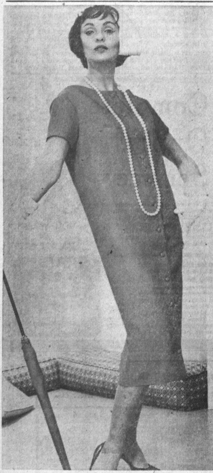
"ZOLOT OF CALIFORNIA" presents the chemise coat dress! In linen, jersey or wrinkle-proof dacron and a variety of colors, this relaxed style is a special favorite in yellow or brilliant