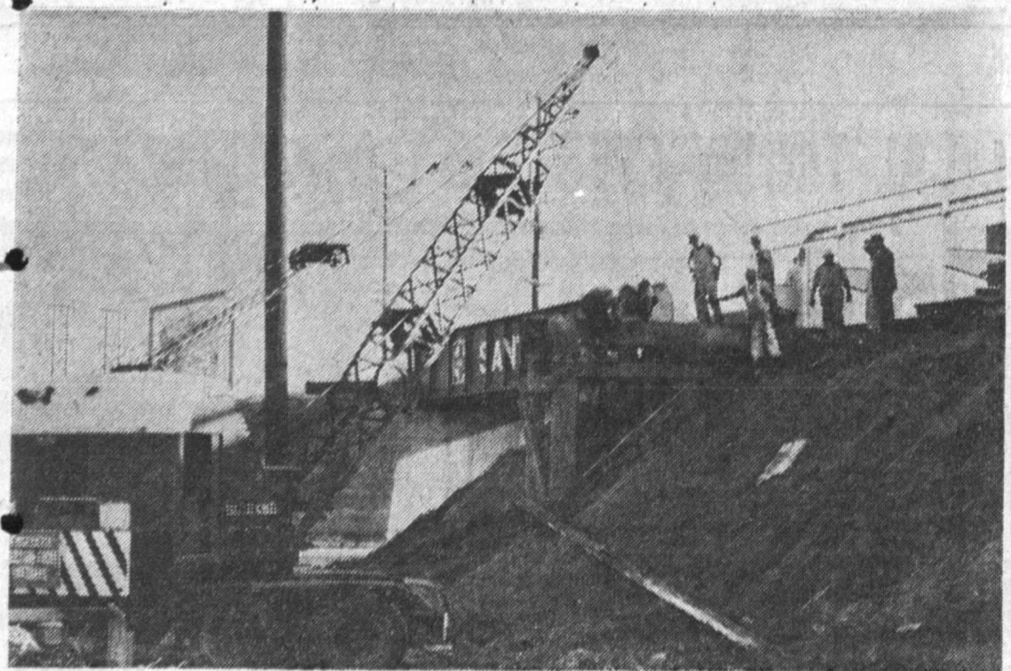
IN PLACE — Huge, 80-ton girder to widen Santa Fe railroad bridge at 190th St. and Haw-thorne Blvd. is put in place. Bridge had to be