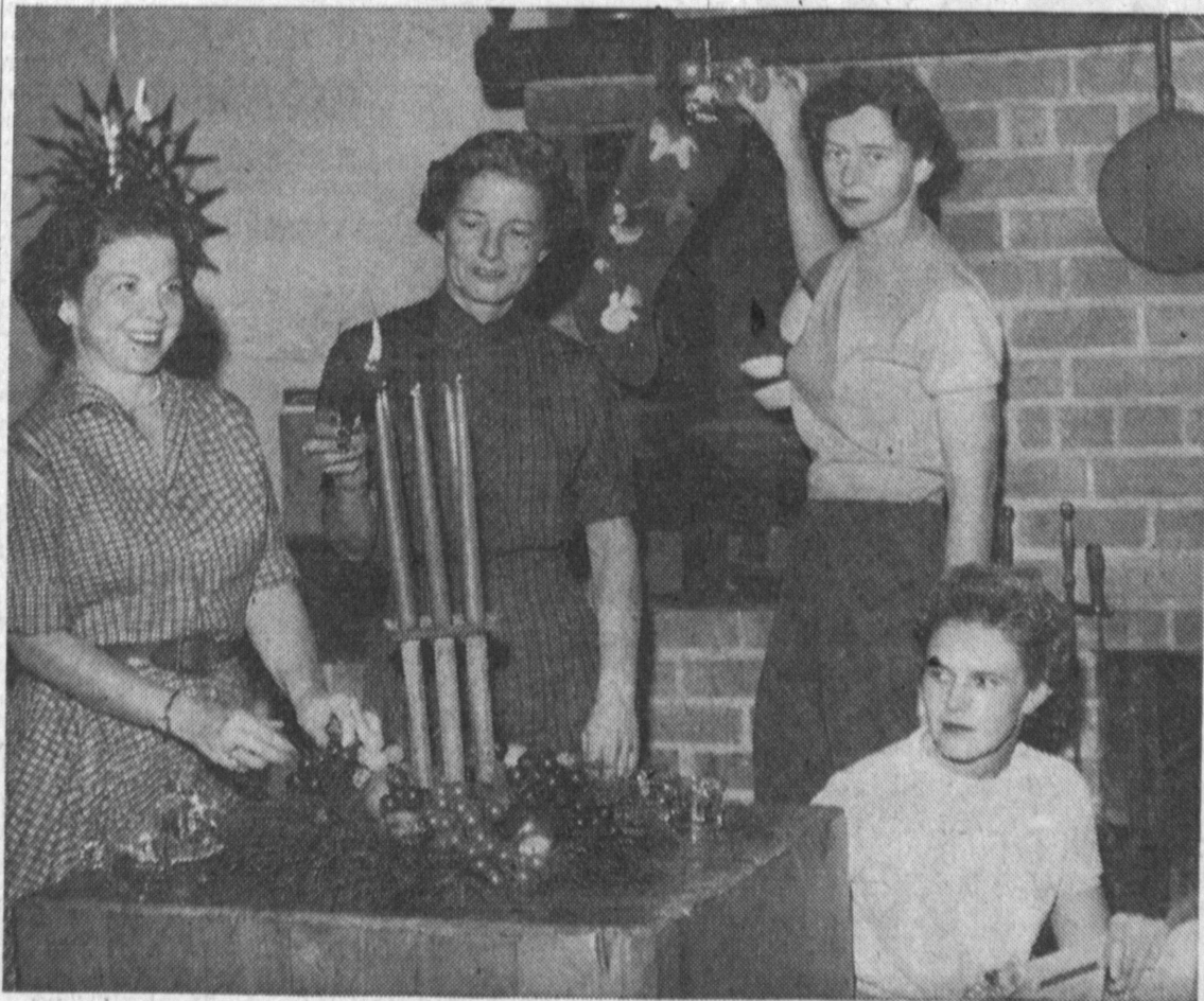
MEMBERS OF THE COMMITTEE who directed the successful Las Fiestadores dance which took place last Saturday at Caprino's are, from