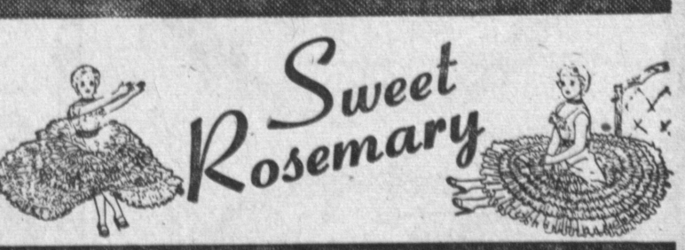
Approx. 30" Tall

Rosemary—the doll of the roses—as sweet, as pink, as delicately clad as a petal with the shimmer of a raindrop still clinging! Rosemary of the pink and sliver lace will bring a budding of