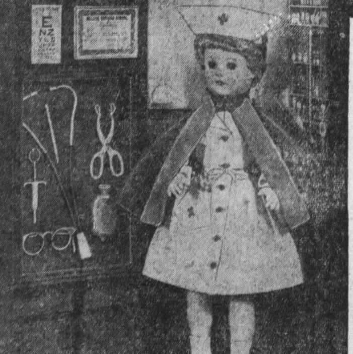
Approx. 24" Tall

Are your little girl's eyes bright...is her heart beating fast...her temperature rising? She doesn't need a doctor-she needs Nancy the Nurse! She's got a case of doll fever-the usual reaction whenever a youngster sets her eyes on adorable Nancy. And who wouldn't get excited about a doll as cute as this one in her crisp white nurse uniform with its perky cap and dashing blue cape?