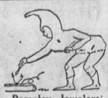
Rampley Jewelers 16701 Hawthorne Blvd. Lawndale FR. 2-1313

OPPORTUNITY GROWS where Want Ads are used! For an experienced ad-writer call FA. 8-2345.