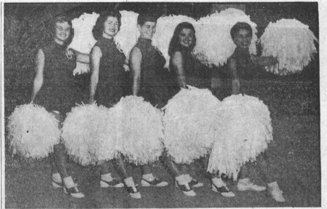
THERE'S A SONG IN THE AIR WHEN THE 1957 Song Queens of El Camino College perform for rooting sections at Warrior games.

The symphony's recent contribution to culture in the South Bay area drew 900 people to a concert that featured the premiere of the "Star Symphony," composed by Edmund Najera, 21-year-old South Bay composer.