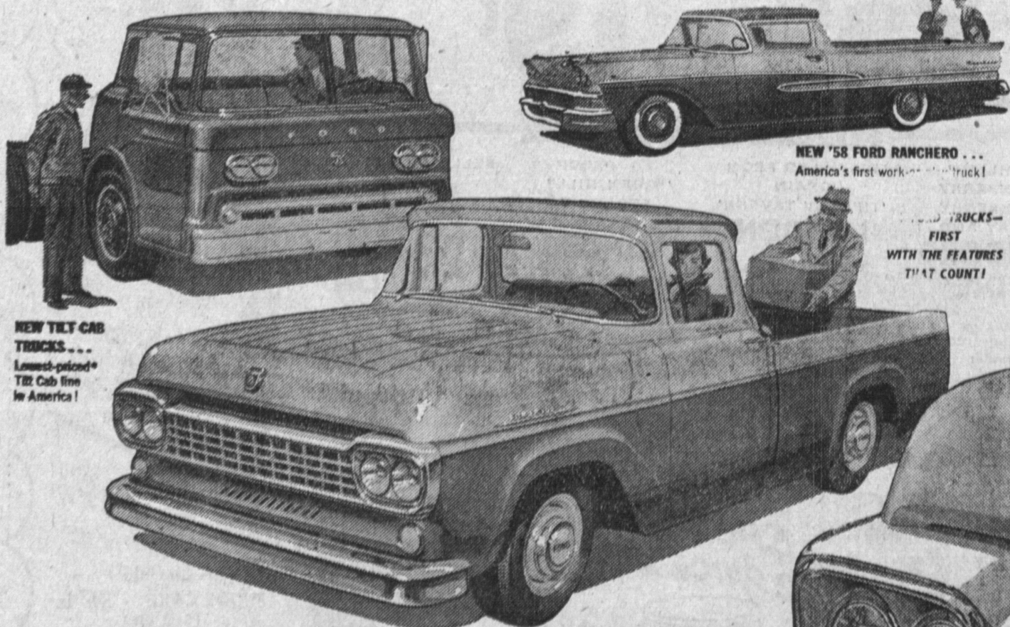
NEW '58 FORD RANCHERO ... America's first work-truck!