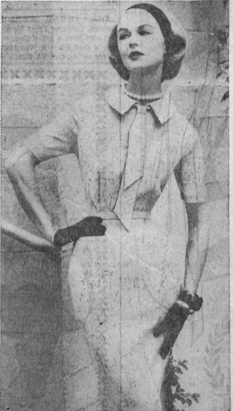
on-the-go shirtdress of wool-look rayon 7.99

Girls in the class learned by seeing and doing, and the question-and-answer period which followed, showed an enthusiastic approach to this phase of the Home Economics course, according to school officials.