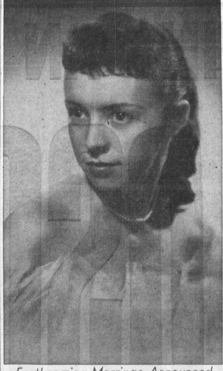
Forthcoming Marriage Announced

520 N. Pacific Coast Hwy. Redondo Beach FR. 4-8333 - 2-8086