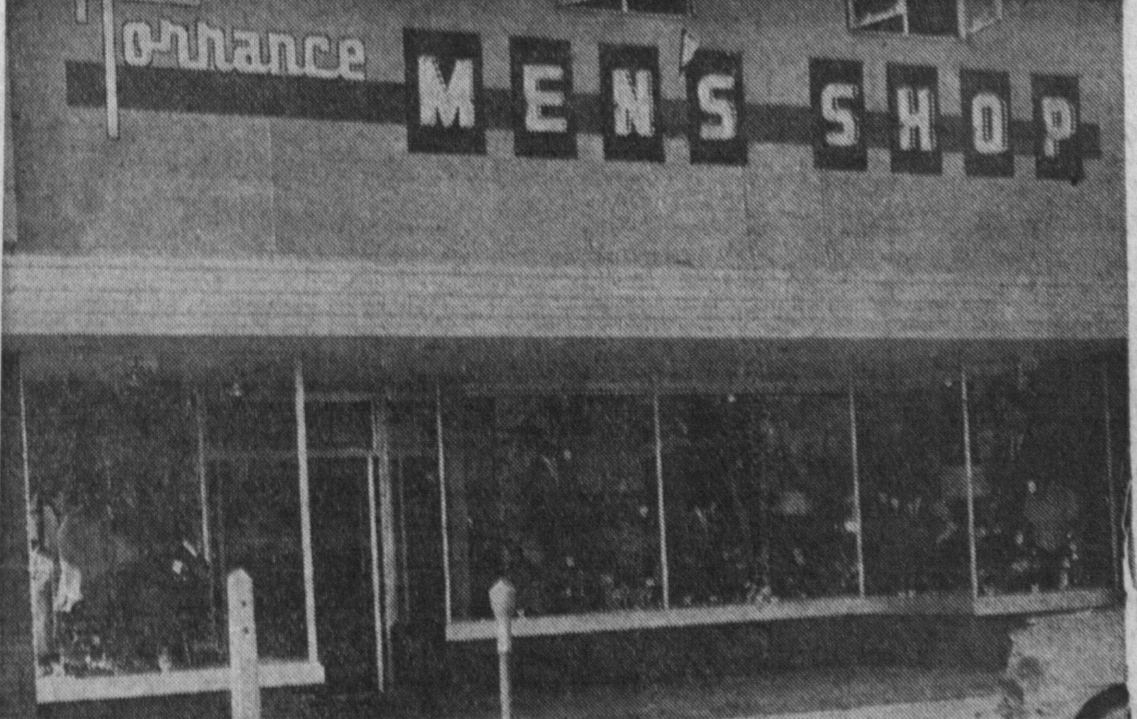
MEN'S SHOP OPENS This week-end marks the official opening of the Torrance Men's shop located on the corner of Sartori and Marcelina in downtown Torrance. New fixtures, new windows, new fall merchandise and additional floor space is part of the city-wide campaign to