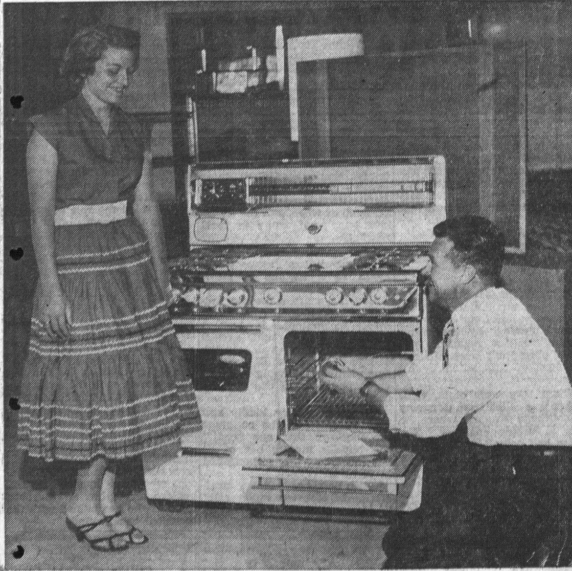
WINS NEW RANGE

A FEW words in the Torrance Press Classified section will solve that sales or rental problem! FA. 8-2345.