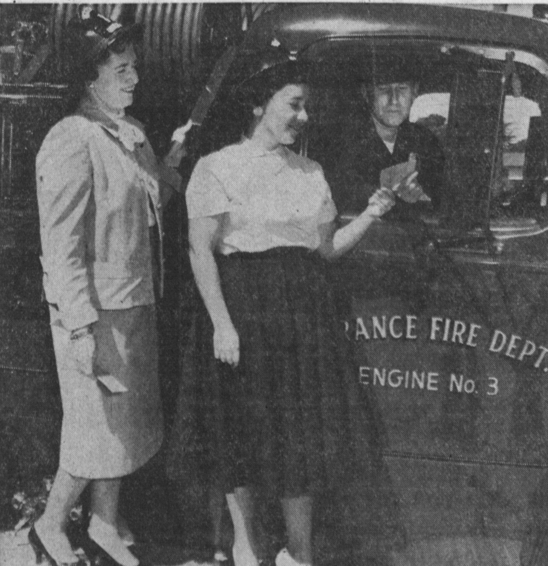
Ticket Sale Gets Underway

"It's just a matter of taking . extra precautions at this time of the year," he said. "Always, just before the rainy season starts, the fire hazards is more pronounced in the wooded sections of Torrance," he conclud-