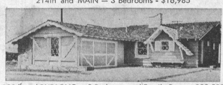
138th and BUDLONG - 3 Bedroom and Family Room $ $22,500