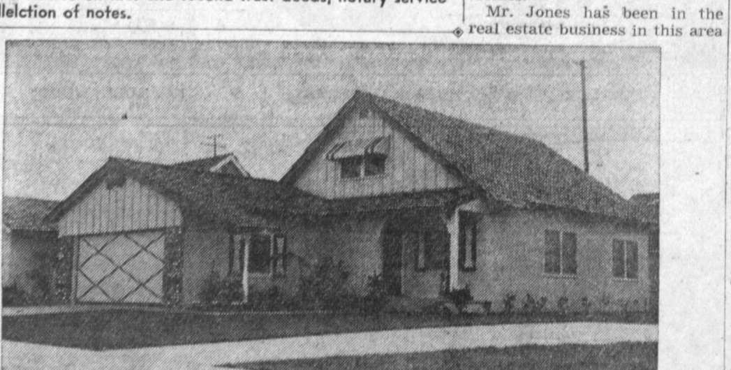
FAIRYTALE HOMES Pictured above is one of the many charming exteriors of the new Fairytale Homes located on Madrona Ave. adjacent to the new Civic Center.

The annual dance will again be a joint chapter-lodge function, and will feature prizes to be awarded for the best and funniest costumes.