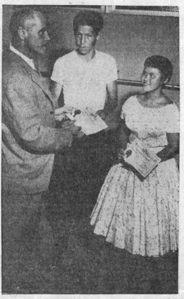
LIFE SAVING CERTIFICATES

many employers find that the Under the Payroll Giving cost of making deductions is