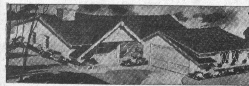
138th and BUDLONG — 3 Bedroom and Family Room (Turn west and follow signs)