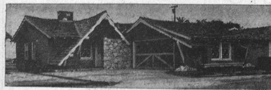
225th and WESTERN - 3 Bedroom and Family Room