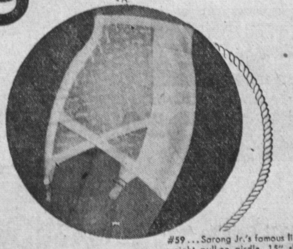
#59... Sarong Jr.'s famous lightweight pull-on girdle. 13" skirt, 2 1/4" elastic collar, nylon mesh-quisette front. 2-way nylon power net sides and back. For junior to average figures. White or black. Sizes S, M and L. $5.95.

Jaxsons IN THE SOUTH BAY CENTER 174th & HAWTHORNE BLVD.