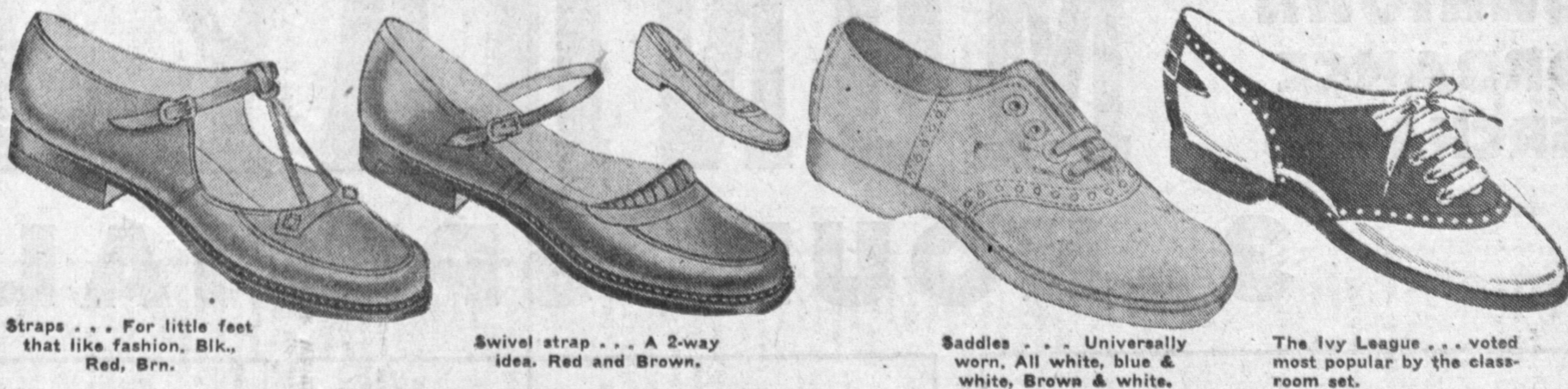
Straps... For little feet that like fashion. Blk., Red, Brn.

TORRANCE 1603 CREVENS AVE. (at Marcelina) • FAIRFAX 8-6111 MAIN OFFICE: INGLEWOOD