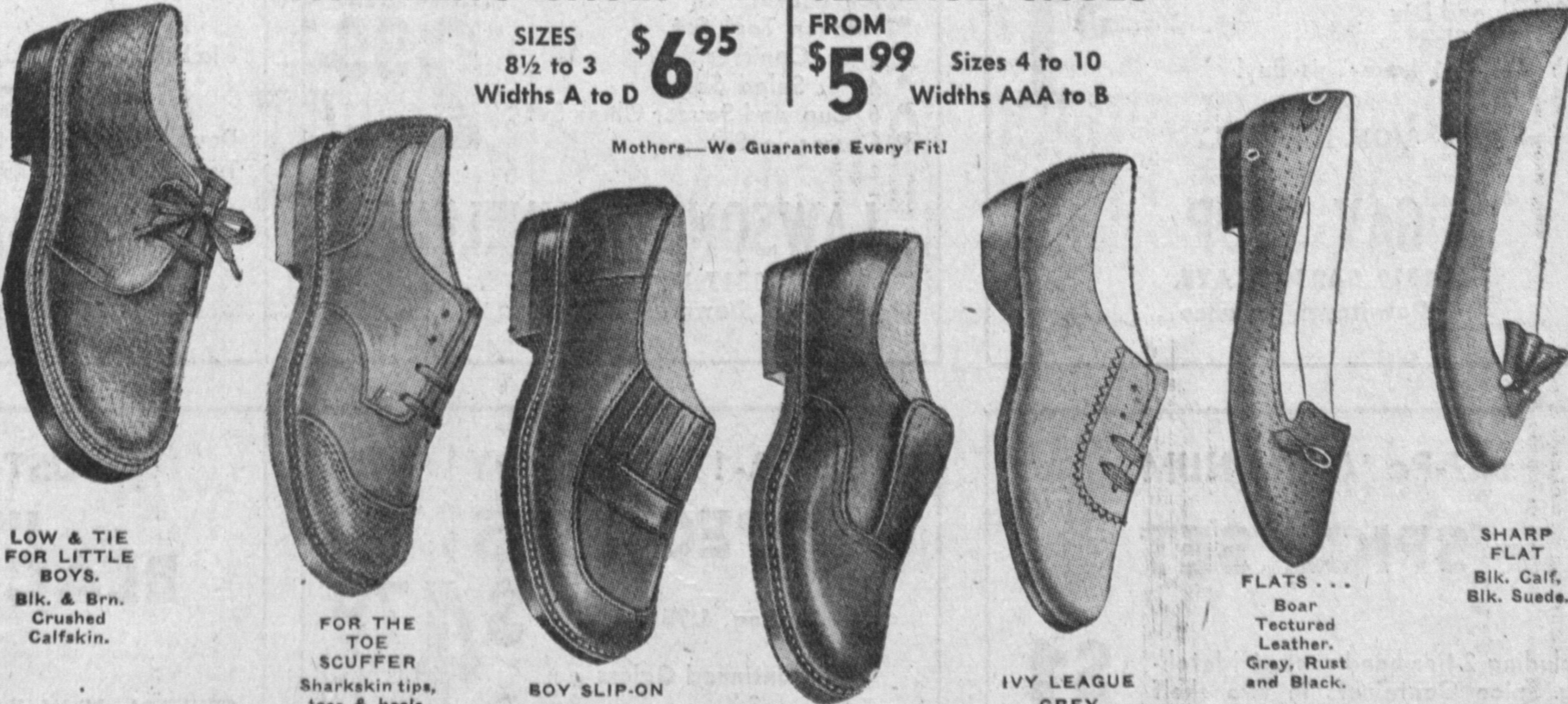
LOW & TIE FOR LITTLE BOYS. Blk. & Brn. Crushed Calfskin.

FROM $5.99 Sizes 4 to 10 Widths AAA to B