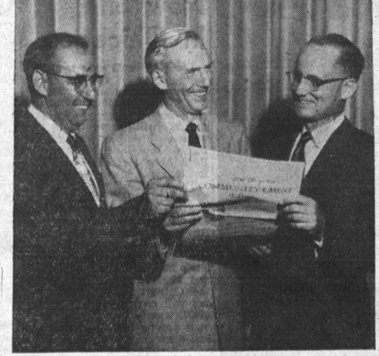
NEW CHEST CHAIRMAN

by latest electronic advances. You get true