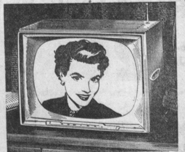
Model T 21 E1