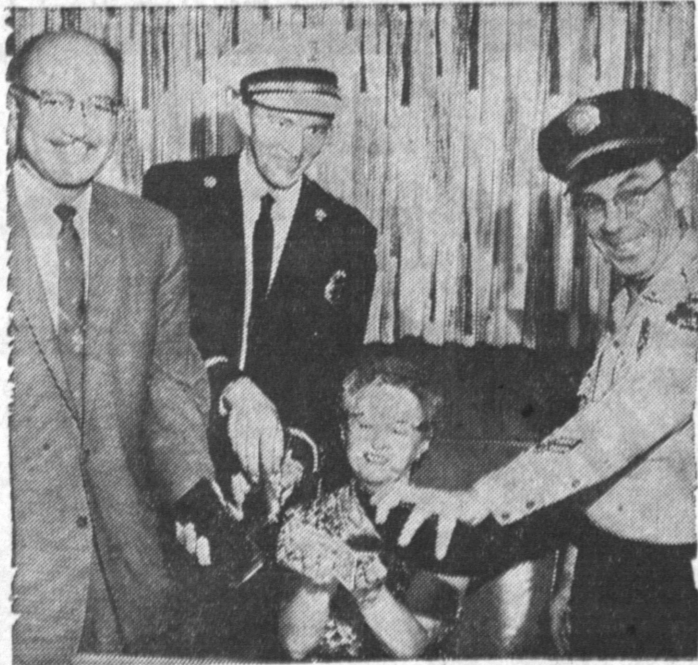
MONEY JUST POURING IN

MEN OCCASIONALLY stumble over the truth, but most of them pick themselves up and hurry off as if nothing had happened.—Winston Churchill.