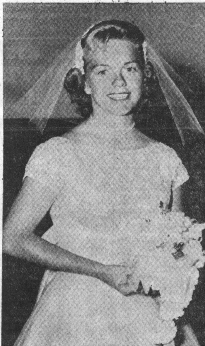
Wed in Methodist Church

The couple will be at home at 15714 Halldale ave., Gardena, after a honeymoon trip to Palm Springs.