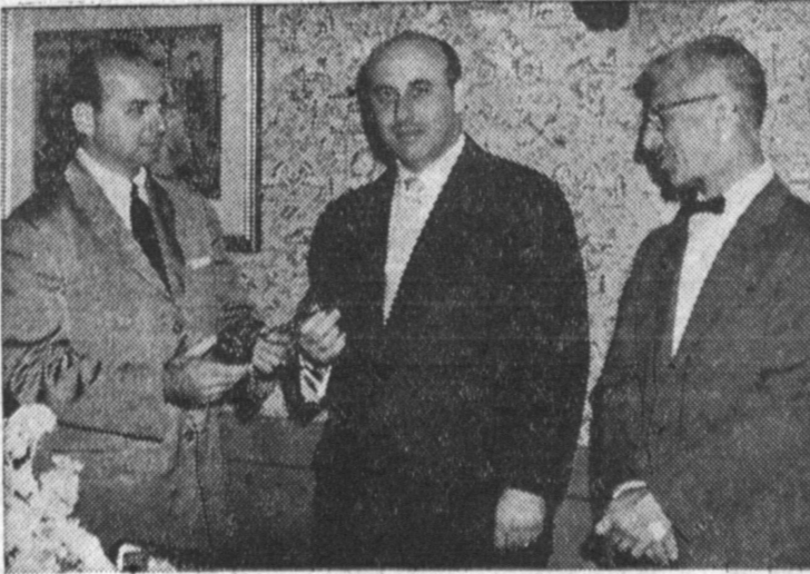
GAVEL CHANGES HANDS

WE FIND it the worst thing about time that we know not what to do with it.—Emerson