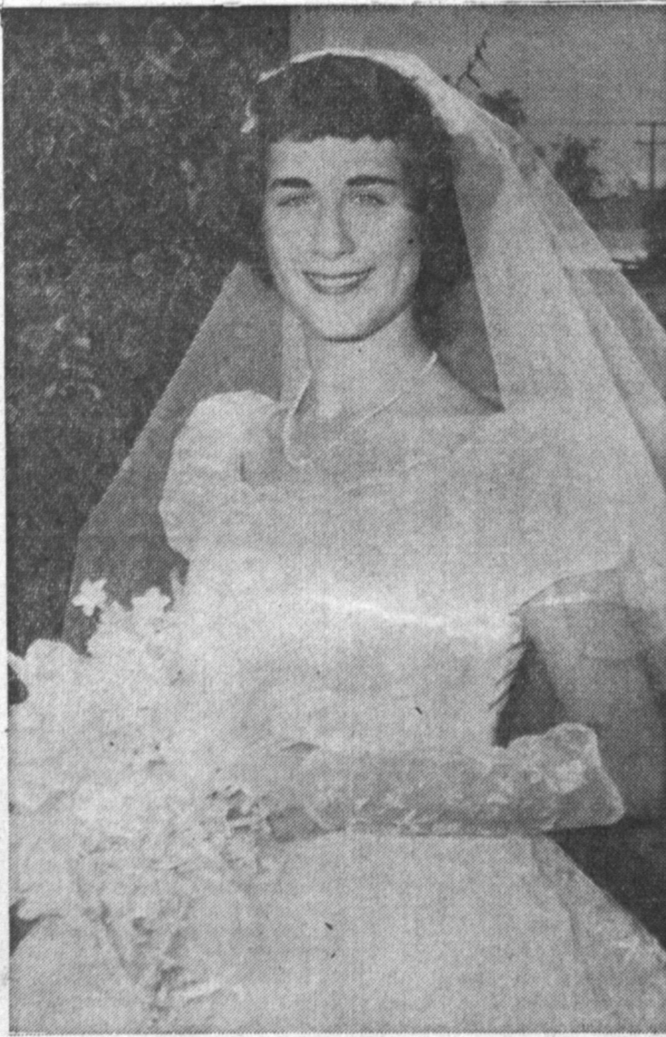
Nativity Church Wedding