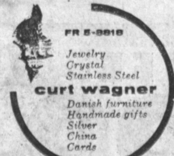
3728 S. CATALINA AVE., REDONDO BEACH, CALIF.

Delegates from approximately 400 Pilot clubs from the United States, Canada, Bermuda, England, Japan, and Hawaii will be in attendance at the convention. Pilot International is one of the five international classified service clubs for executive