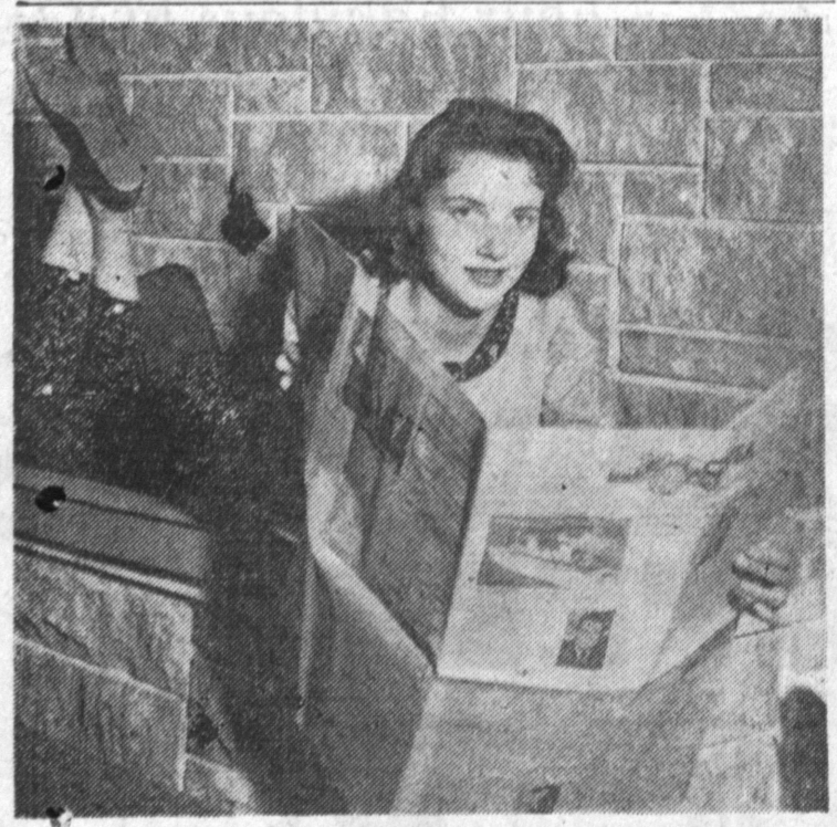
Food For Thought

"Walk together, talk together, o ye peoples of the earth; then and only then, shall ye have peace."