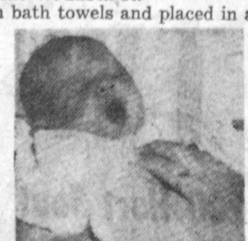
ABANDONED BABY . . . didn't cry