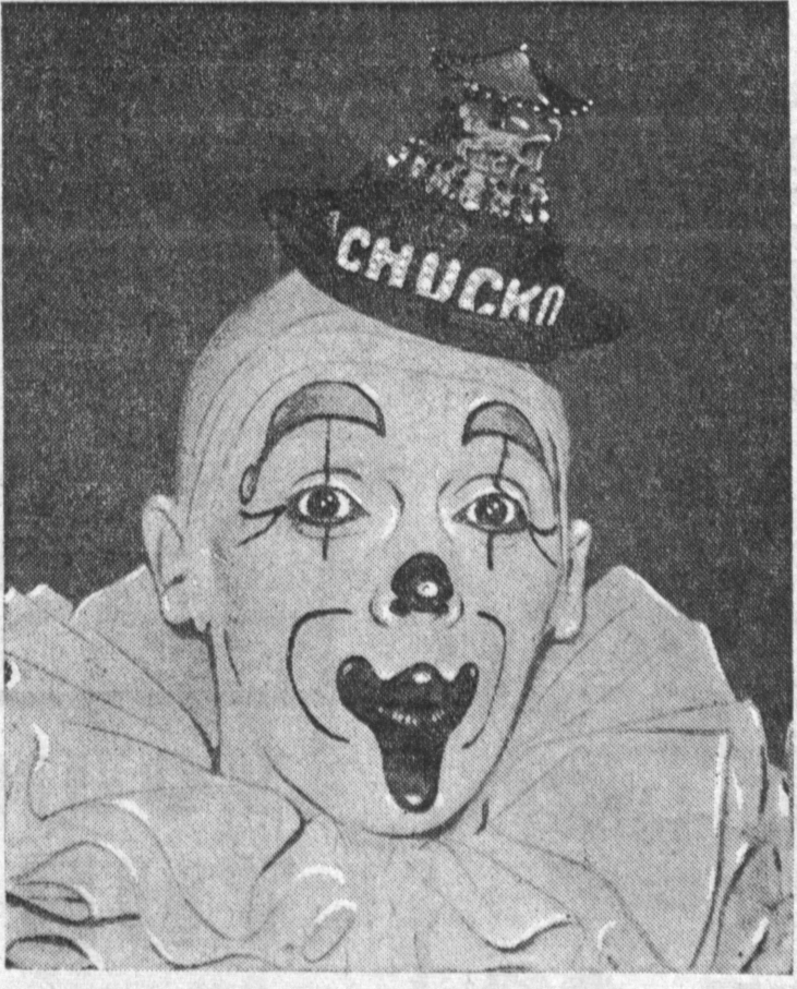
PRESENT: Chucko the clown will be at Ralphs new market, Redondo Beach and Hawthorne boulevards, Saturday morning, 10 o'clock with his tricks of magic.