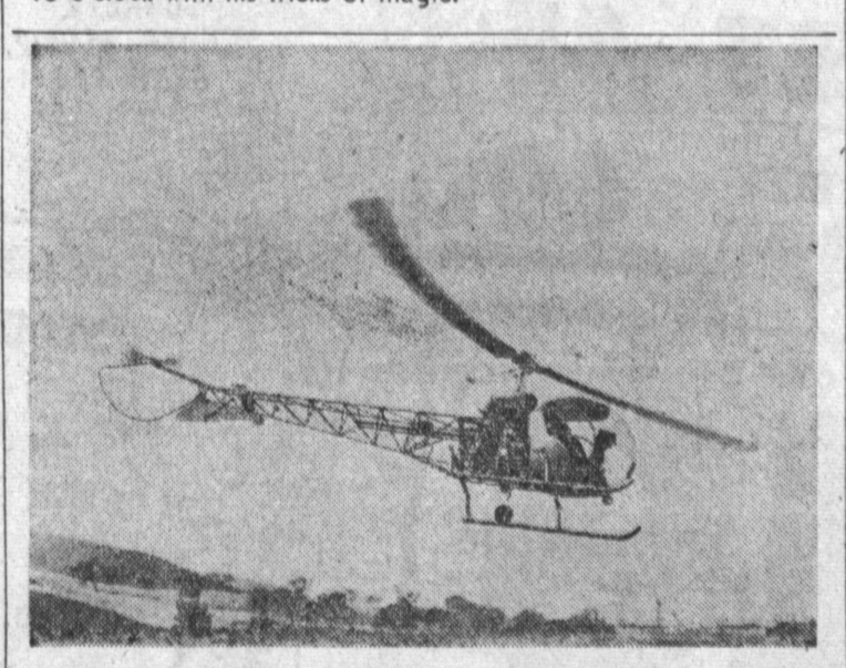
HERE SATURDAY: "Whirleybird" helicopter will be at Ralphs new market, Redondo Beach and Hawthorne boulevards, Satur-