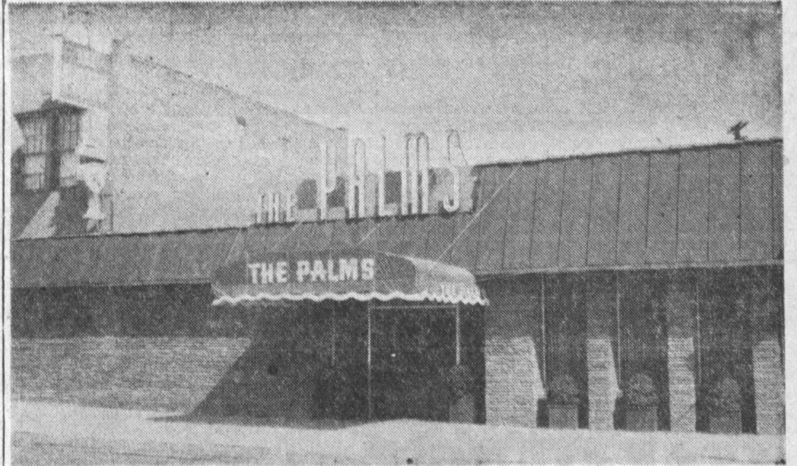
FOODS, COCKTAILS, ENTERTAINMENT Among the outstanding restaurants in Torrance is the Palms located at 1925 Carson ave.

Features include genuine "knock on the wall" lath and