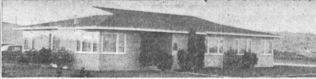
AMERICAN ROCK WOOL The bulk of the mineral wool used for building insulation is sold in the Los Angeles area, although the firm services the West Coast .- Press Photo.

In addition to its ambulance service, South Bay Ambulance offers sick room supplies, oxygen service and a physician's exchange service .- Press Photo.