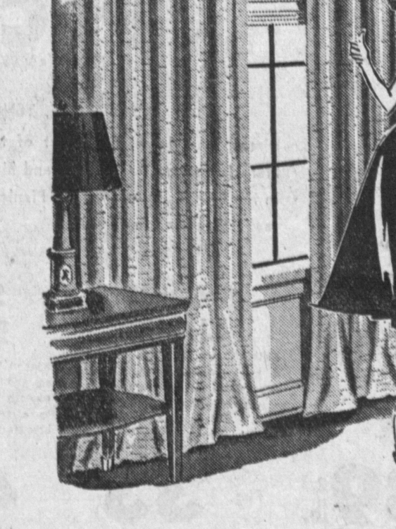
Figure your own window . . . Add $7.50 per foot for wider windows . . subtract $7.50 per foot for windows less than 10 feet wide.