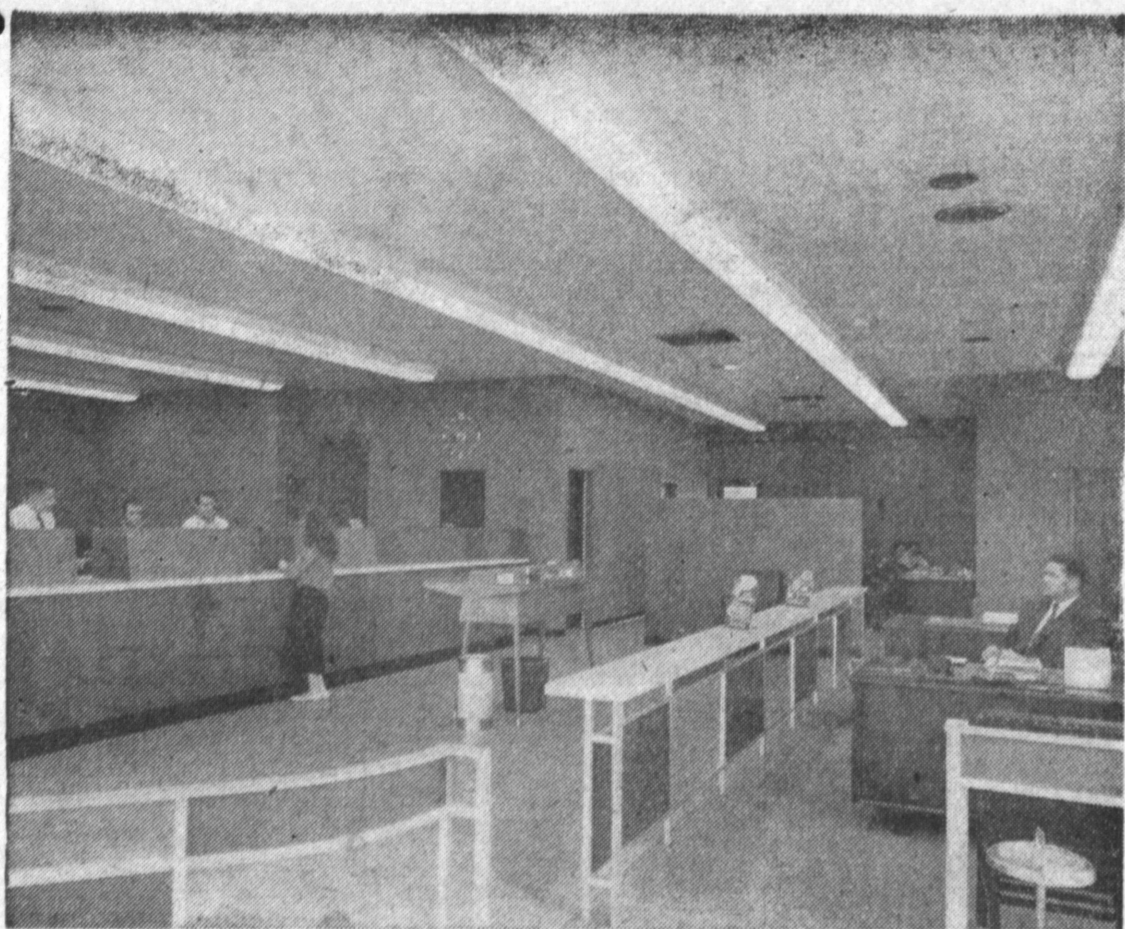
MODERN NEW LOCATION

Southwest Savings and Loan's spacious new building is now open to the public.